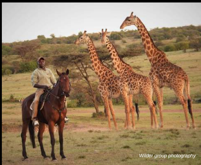
Wilder group photography