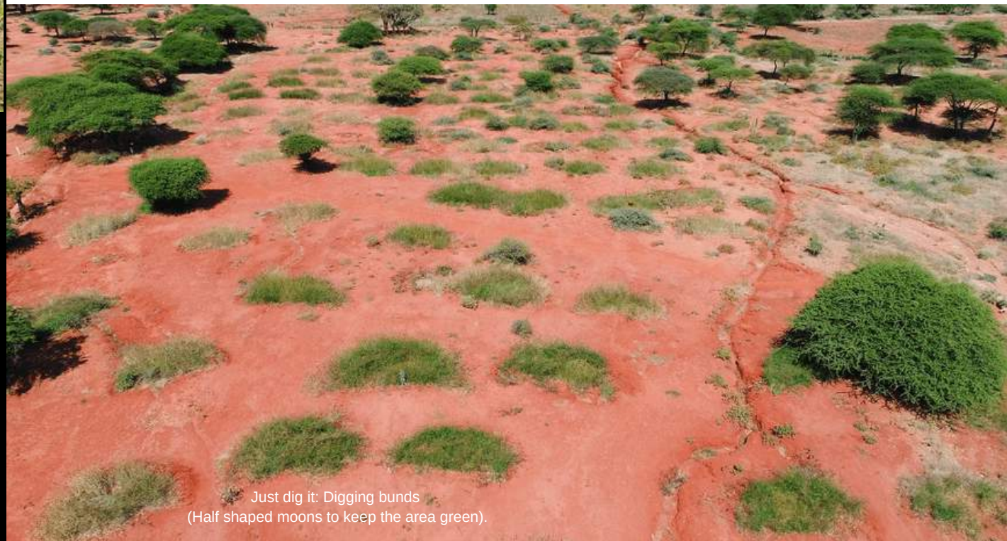
Just dig it: Digging bunds (Half shaped moons to keep the area green).