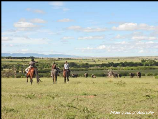
Wilder group photography