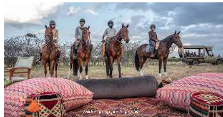
Wilder group photography