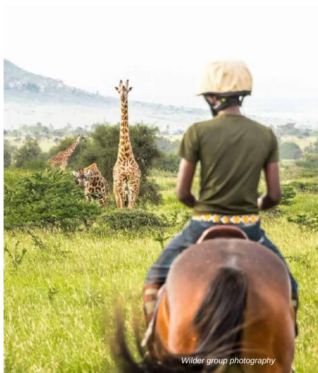
Wilder group photography