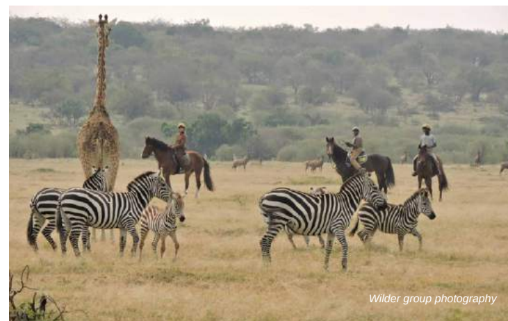
Wilder group photography